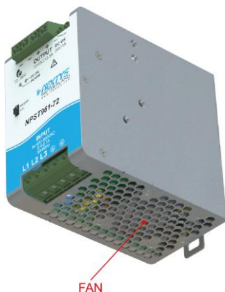
Fig. 1- 960W SMPS